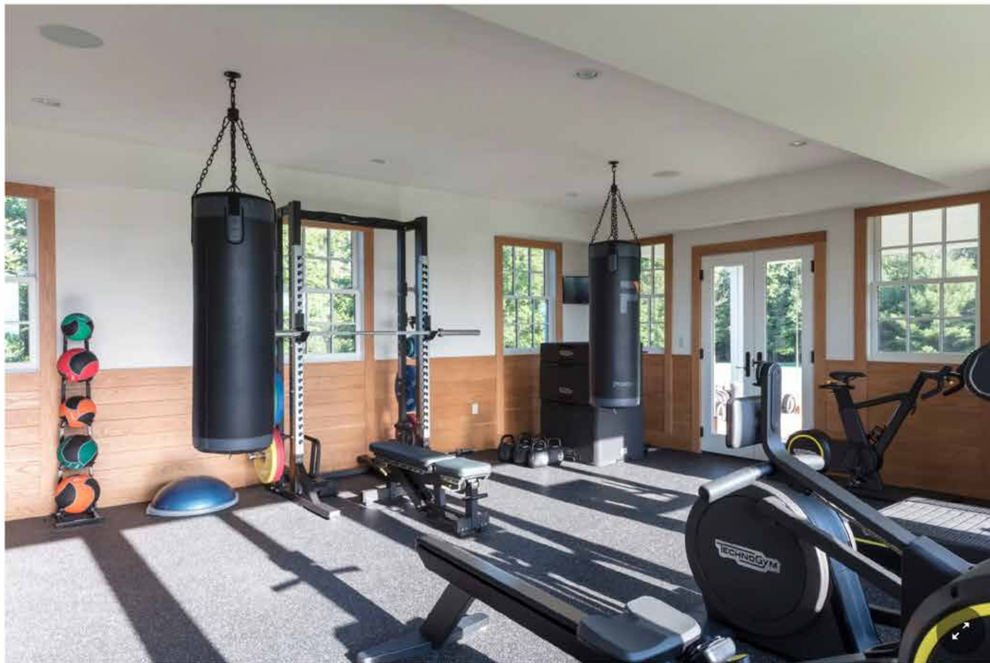
A home gym created by Crisp Architects and Valerie Grant Interiors has protective wainscoting and resilient flooring. Antoine Bootz

It's also important to leave space for floor exercises, Ms. Story said. “You don't want to go into a gym where it's just all machines,” she said, because it could feel claustrophobic. Leaving open space at the center of the room will make your gym feel less cramped, while also providing room for yoga, stretching and calisthenics.