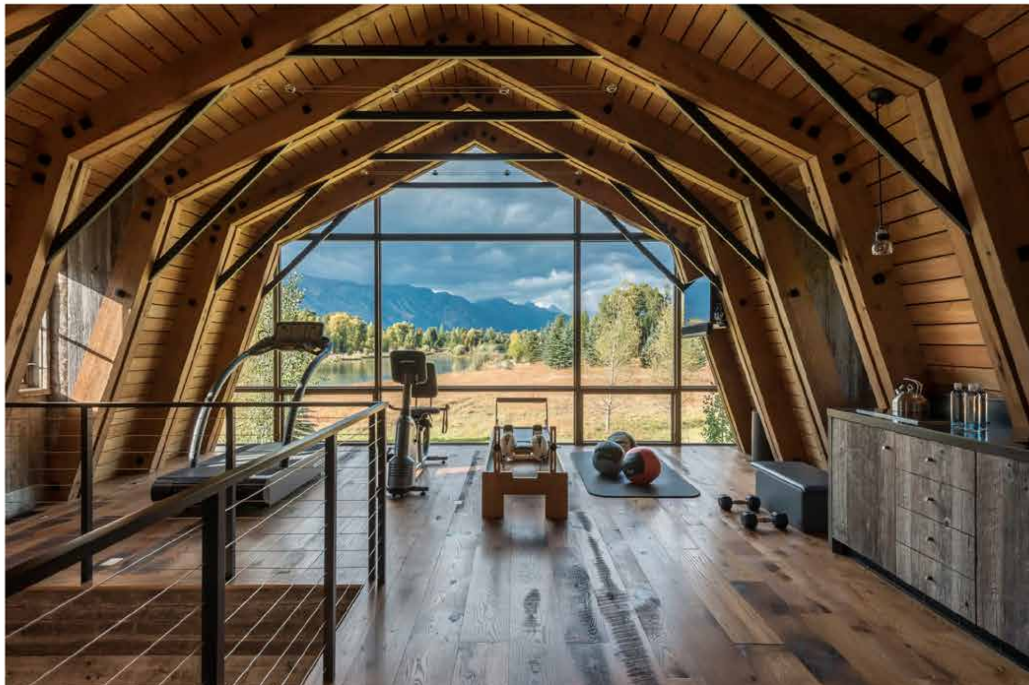
In this home gym by CLB Architects and WRJ Design, a cabinet conveniently holds small appliances and essentials like water and towels. (There's also a nice view.)