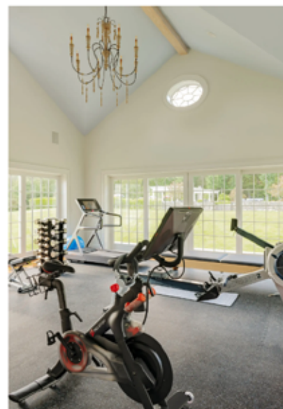
Another home gym designed by Crisp Architects is finished with a decorative chandelier.

All of the designers interviewed for this story also suggested adding mirrors — either mirrored walls or large framed mirrors — to enlarge the sense of space and let you check your form as you work out.